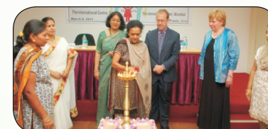
Lighting of the traditional lamp