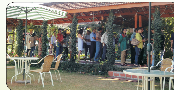
Long line of participants for the organic gardening workshop

We had two very exciting seminars on the girl child and consumer rights and a very thought provoking workshop on the unfortunate suicides that are rocking Goa-which also happens to have a 17% suicide rate, compared to India's 10%. The youth are especially vulnerable-it is really sad that the more we are moving towards globalization, the more we are moving away from our values and traditions-there is a disconnect between parents and children, teachers and students, compounded with stress and depression, leading the very sensitive ones to take their own life. The workshop came up with a 9 point charter, which was circulated to the media.