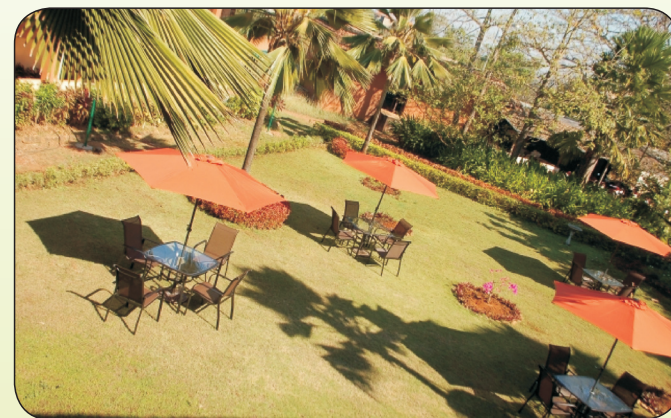
Block A Lawn- Shyamali

For details about membership, programmes and facilities, please visit our website: www.internationalcentregoa.com Our quarterly e-newsletter is now available on www.goadialogues.com and www.internationalcentregoa.com