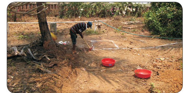
Recharging of our borewell work in progress

Well it was not only all work and more work in these three months—we organized a wonderful jazz evening with some Dutch musicians and Heritage Jazz-called 'Jazz for Goa' –it took up the cause for cleaning and beautifying Panjim and its heritage sites.