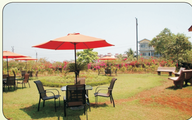
Block B Lawn- Sheovtem