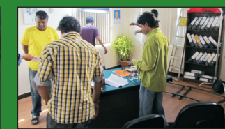
ICG AS A VENUE FOR FILM SHOOTING – HINDI-BENGALI FILM FROM 16TH TO 31ST MARCH 2011