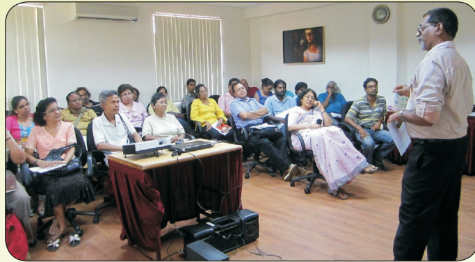
The participants at the workshop

A Workshop on 'Planting an Organic Summer Kitchen Garden' was held on March 19, 2011. In this workshop participants and faculty worked together to set up a summer kitchen garden patch for a varied set of organic vegetables. The objective of this workshop was to provide participants with a detailed, first-hand practical experience of what needs to be done, along with tips to ensure protection from pests and obtain better yields.