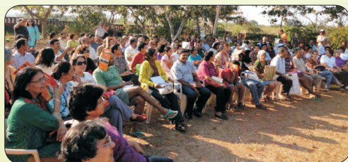
The participants at the workshop

and chillies in pots and small garden spaces. The workshop was held in our own organic vegetable garden - Shaak Baag.