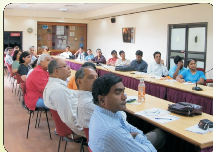
The participants at the discussion

Experts, during the three hour long discussion urged the media not to sensationalise suicides and to curb graphic details of it. The workshop was organized following concerns raised in different sections of society over recent spate of suicides by youth and school- children in particular, in different parts of the State ahead of exam season. At the end of the seminar a Charter of demands was given to the media.