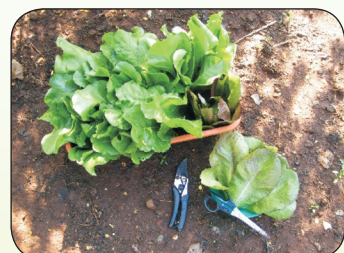
Fresh Spinach and Red Lettuce

The International Centre Goa and Green Essentials co-organised a workshop on 'Organic Kitchen Gardening in City & Urban Spaces' on January 16 and 23, 2011. The workshop provided hands-on information and showed participants how to grow their favourite vegetables like tomatoes, capsicum, basil, spinach, radish, lettuce, fenugreek