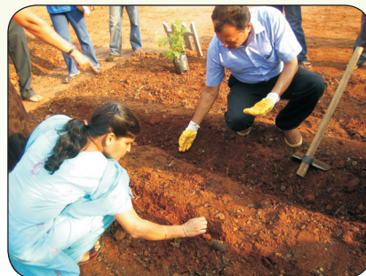
The participants planting seeds in the 'Shaak Baag' at ICG

A Workshop on 'Planting an Organic Summer Kitchen Garden' was held on March 19, 2011. In this workshop participants and faculty worked together to set up a summer kitchen garden patch for a varied set of organic vegetables. The objective of this workshop was to provide participants with a detailed, first-hand practical experience of what needs to be done, along with tips to ensure protection from pests and obtain better yields.