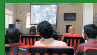
INDIA V/S PAKISTAN MATCH- SEMIFINALS OF ICC WORLD CUP ON 30TH MARCH 2011 @ ICG